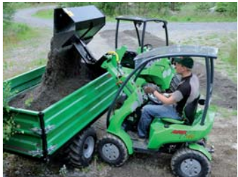
High tip bucket