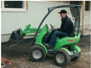
General & light material buckets