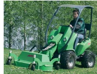
Lawn mower (also with collector)