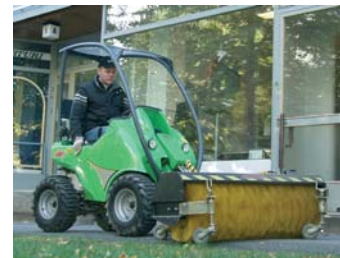
Rotary broom (also with collector)